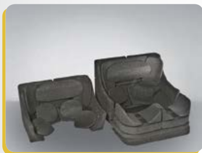
21 Modular configurable inserts