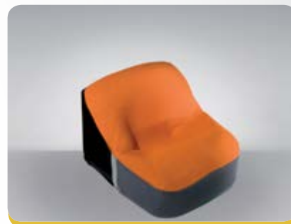
The alternative to traditional seating shells