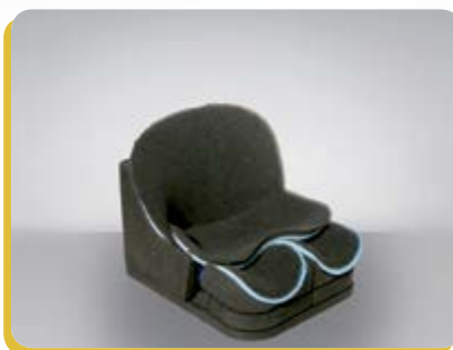
Free Shape Padding